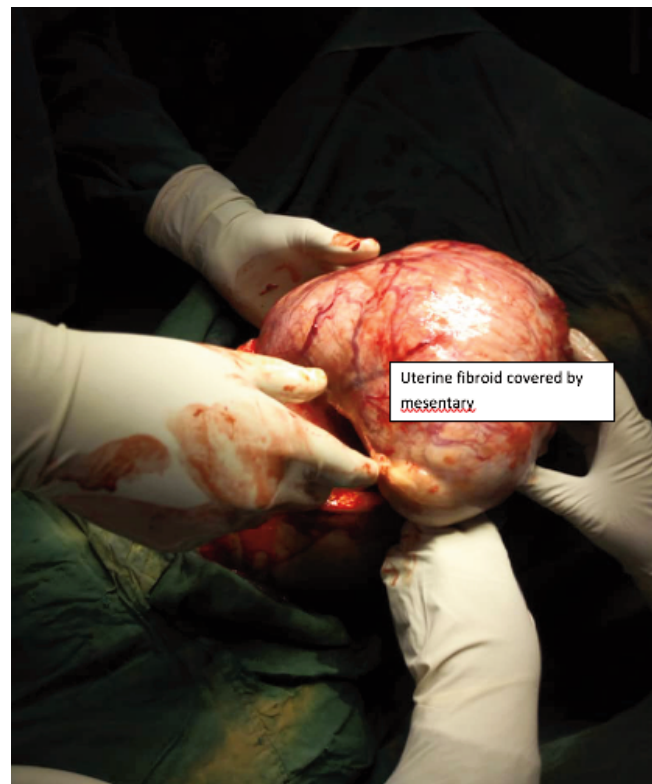
Figure 2. Pedunculated subserous fibroids covered with omentum.