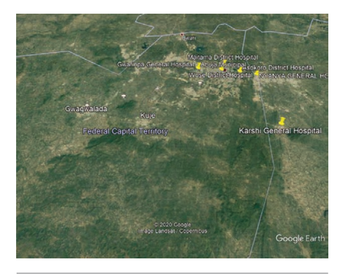
Figure 1. Geospatial map of public secondary health facilities in AMAC.

Prior to data collection, interviewers, supervisors, coordinators