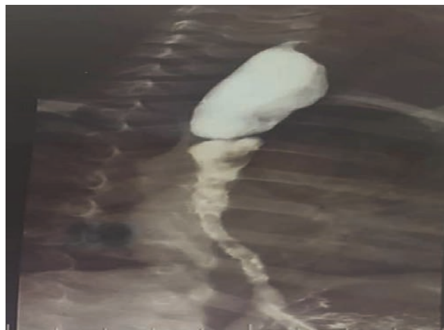
Figure 2. Barium studies. There is a tight but passable oesophageal stricture distal to the cervicothoracic junction. Esophagus distal to this point shows progressive generalized luminal narrowing, with loss of peristaltic activity with a normal stomach, consistent with a corrosive esophageal stricture.