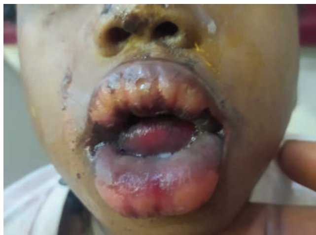
Figure 4. Oral burns, including lip and tongue erythema, edema, leukoplakia, and ulceration following corrosive ingestion.