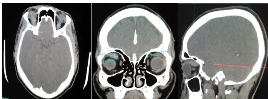
Figure 3. Cranial CT scan (Axial, Coronal and Sagittal views) showing right superior rectus muscle enlargement suggestive of idiopathic orbital inflammation.