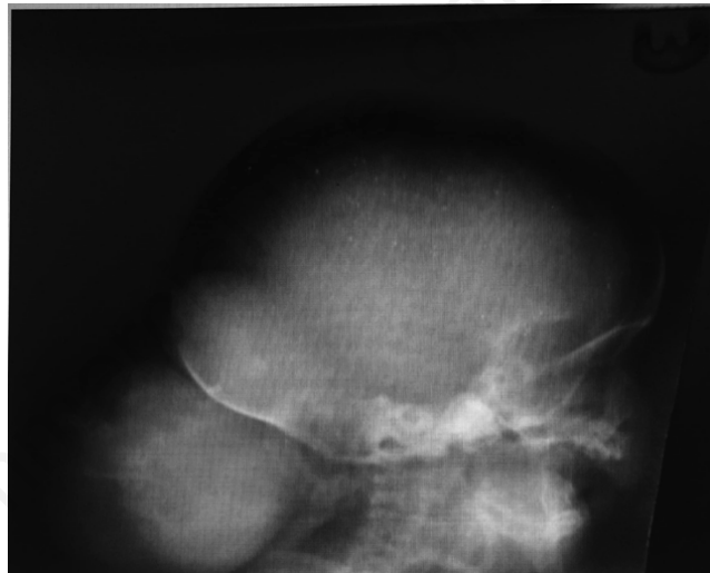
Figure 2. Lateral skull radiograph of the infant showing the occipital component of the soft tissue mass with internal calcific elements. The adjacent occipital bone is intact.